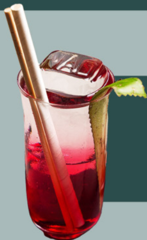
BITTER HALF WHITE WINE LIQUEUR, BITTERSWEET ORANGE, TONIC