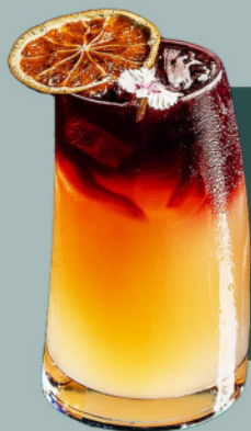
NAOSTALGIC NAO'S LIIT, FLOATING RED WINE